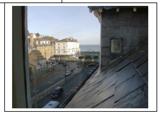
Flat C, 15 Gloddaeth Street, Llandudno ref: GEL078